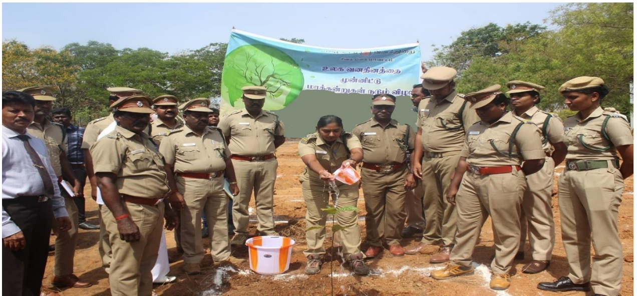
Tree plantation for the occasion of international forest day at Theli village on 20.03.2021

On March 20, 2021, Pandian Saraswathi Yadav Engineering College organized a successful Tree Plantation Program at Theli. The event aimed to promote environmental sustainability and increase green cover in our area. A diverse group of over 22 volunteers, including students, faculty members and local residents, participated enthusiastically. The program commenced at 10.30 AM with an opening speech by our college Principal, who emphasized the importance of tree planting in combating climate change and improving air quality. Following the speech, experts from the police department provided a brief workshop on proper planting techniques and the benefits of different tree species.