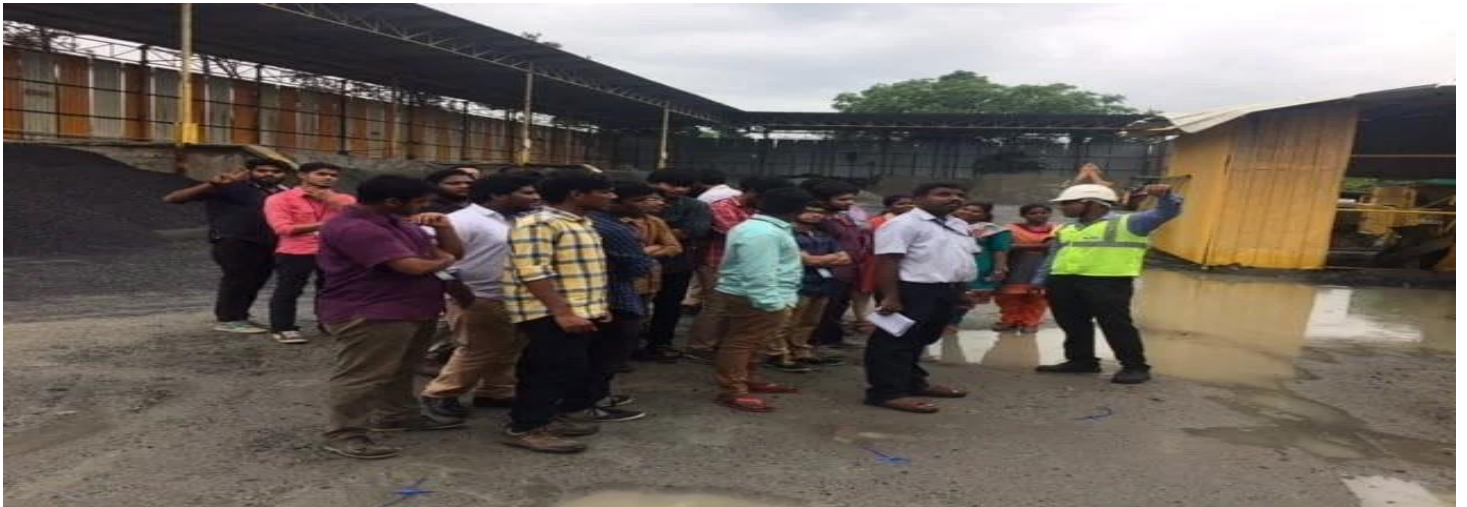
Industrial Visit to Harini Construction – Soorya Nagar Madurai