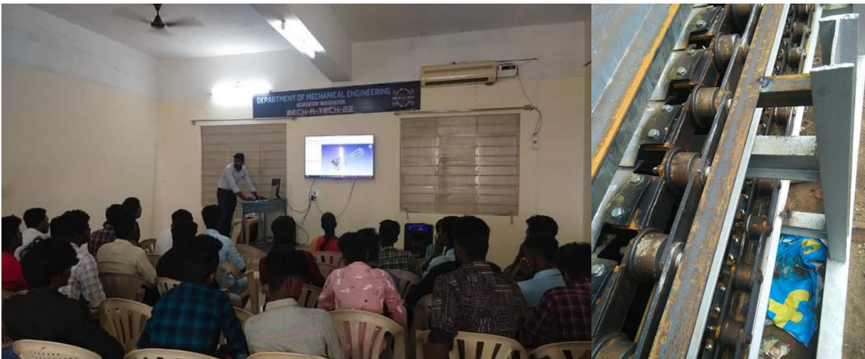
Students participating in the Design of Rubber components using SolidWorks

He emphasized their widespread use in industries such as automotive, aerospace, and consumer goods due to their unique properties. Also he explained the SolidWorks Software including 3DModeling, Simulation, Analysis, Drawing and Documentation. The expert presented several case studies to illustrate the application of SolidWorks in designing rubber products such as Automotive Seals, Vibration Dampers, Consumer Goods.