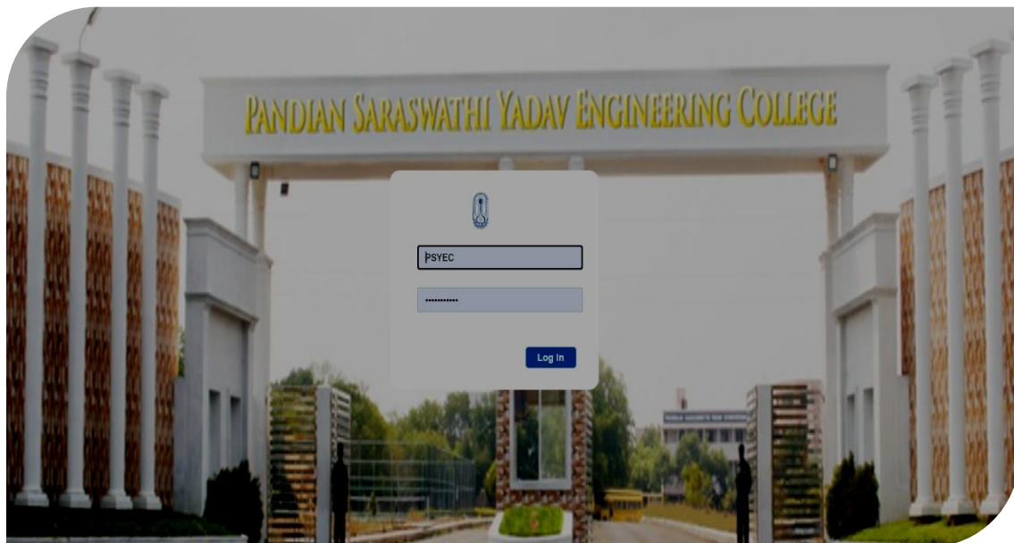
Login Page - ILMS