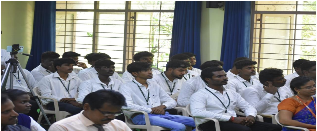
Seminar on “Sigaram Thodu”

Pandian Saraswathi Yadav Engineering College organized seminar on “Sigaram Thodu” (16 th March 2022) in college premises. The session commenced with the welcome address. He gradually delivered his valuable knowledge to students about explore the latest technological advancements in civil engineering, the application of new materials and construction techniques and analyze case studies demonstrating innovative solutions and finally to discuss the future trends and challenges in the field. The seminar "Sigaram Thodu" highlights the transformative impact of innovations in civil engineering. By embracing advanced materials, construction techniques, and sustainable practices, the field can address current challenges and meet future demands. Continued research and collaboration between academia and industry are essential to drive these innovations forward.