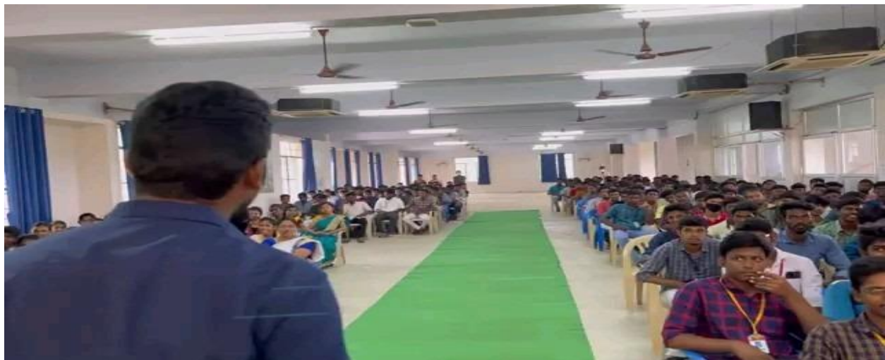
Guest Lecture on 'Seminar on CCTV Cameras Installation' on 15.03.2023