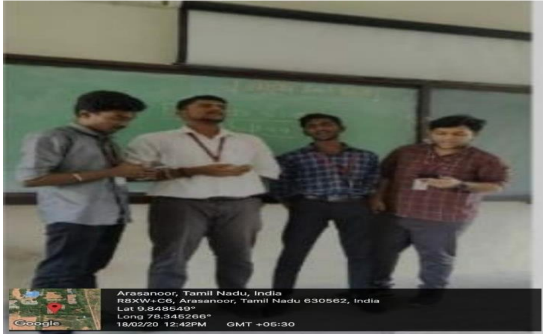
The Singing Competition-Group started with participants in front of the staffs and the students coordinators