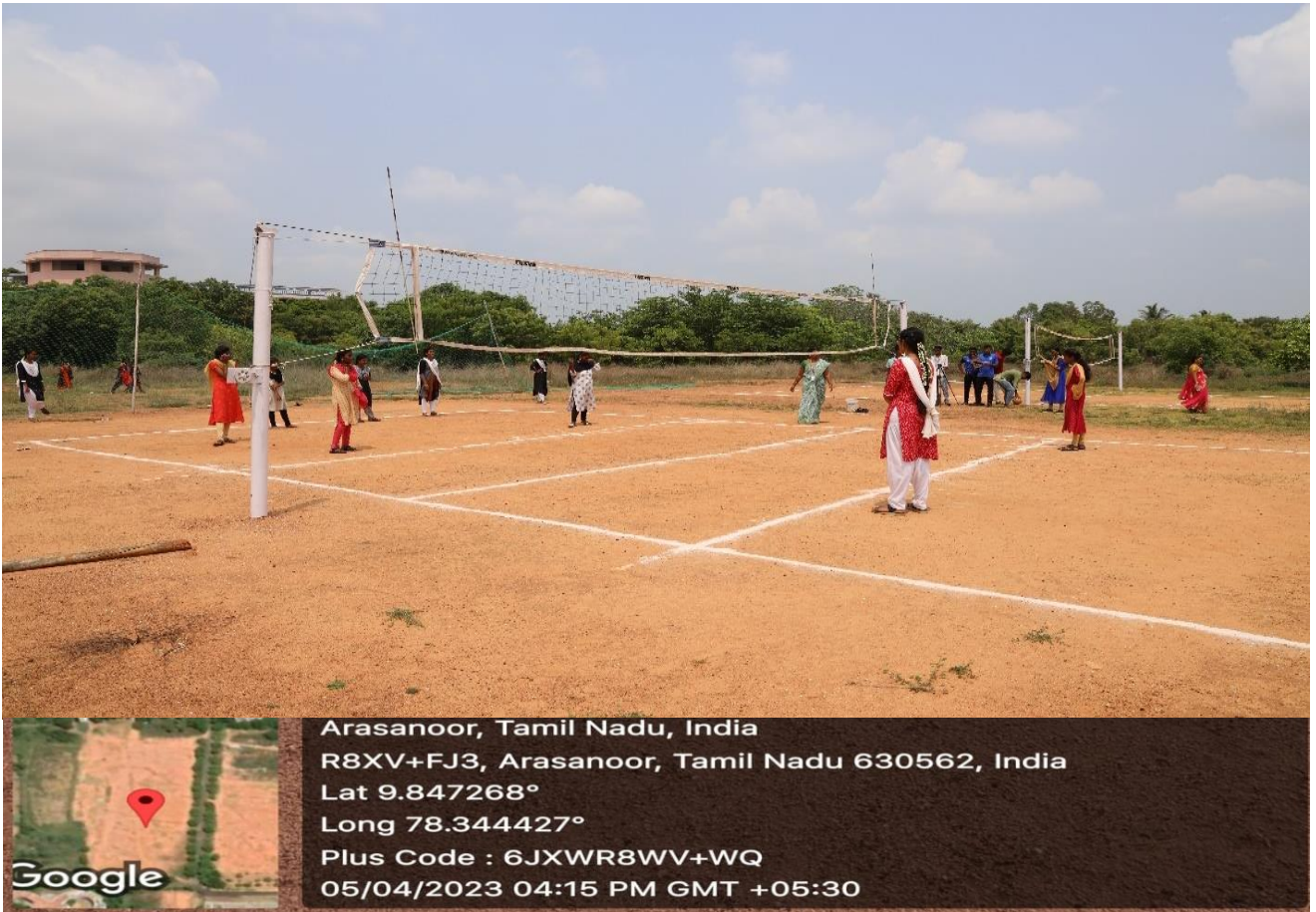
Students are actively participated in women Volleyball game at PSYEC college ground on [05-04-2023]