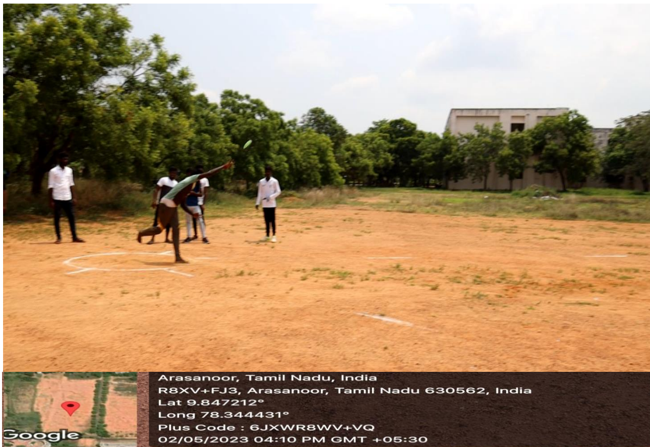
Students are actively participated in men Discus throw game at PSYEC college ground on [02-05-2023]