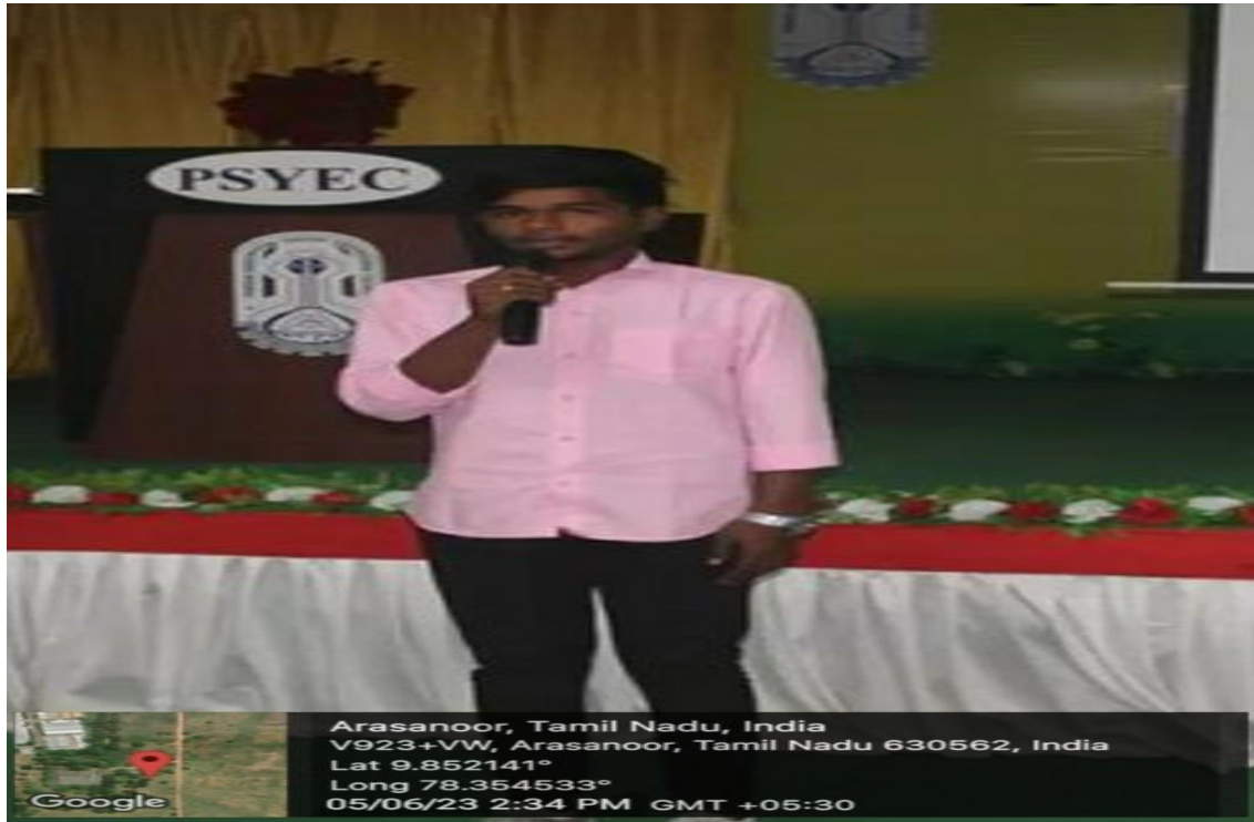
The Speech Competition -Tamil started with participants in front of the staffs and the student's coordinators