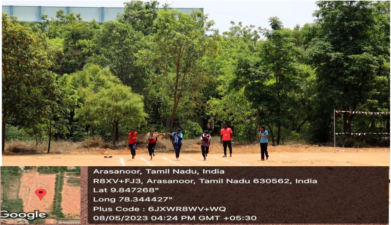
Students are actively participated in women 100 Mts Track game at PSYEC college ground on [08-05-2023]