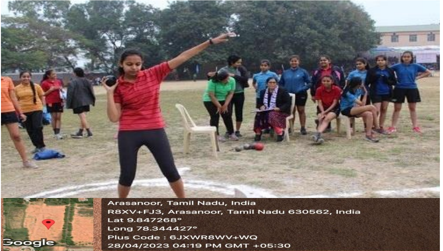
Students are actively participated in women Shotput throw game at PSYEC college on 28-04-2023