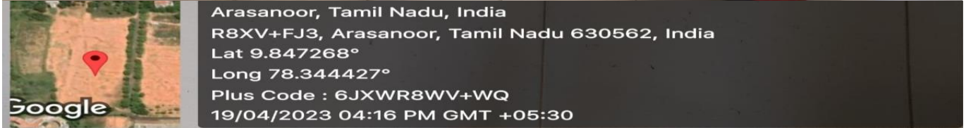
Students are actively participated in women Chess game at PSYEC college ground on [19-04-2023]