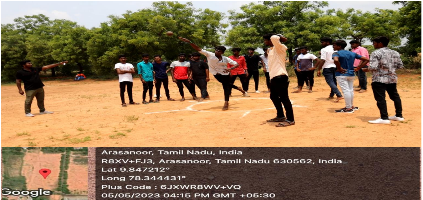
Students are actively participated in men Shotput throw game at PSYEC college ground on [05-05-2023]