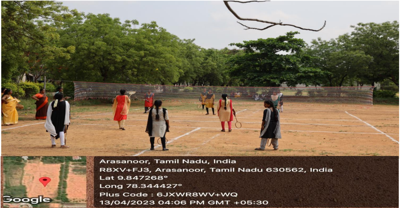
Students are actively participated in Women Ball Badminton game at PSYEC college ground on [13-04-2023]