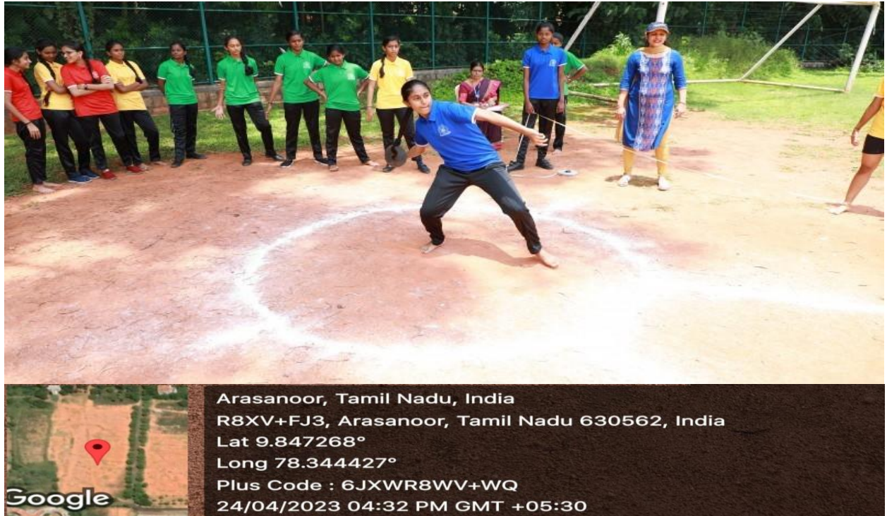
Students are actively participated in women Discuss throw game at PSYEC ground on 24-04-2023