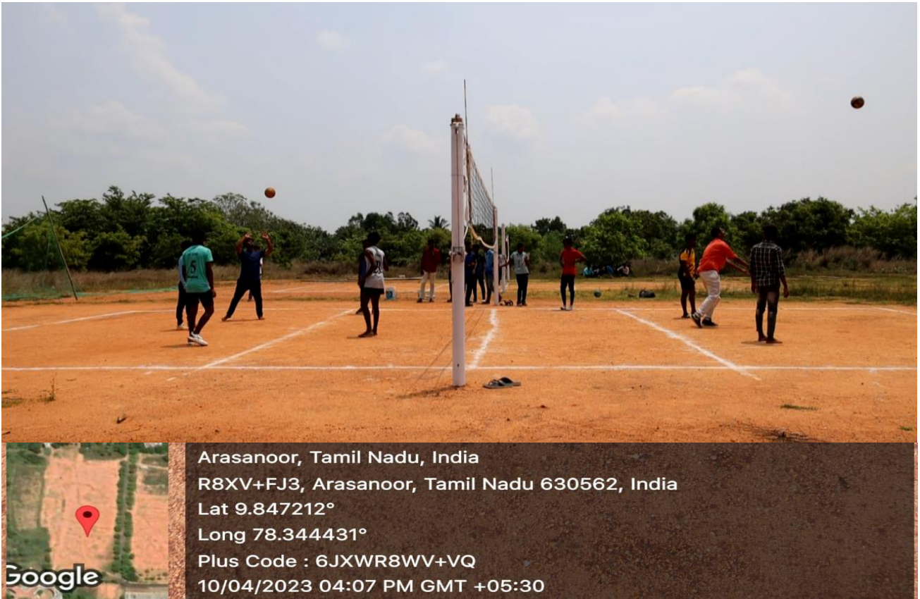
Students are actively participated in men Volleyball game at PSYEC college ground on [10.04.2023]