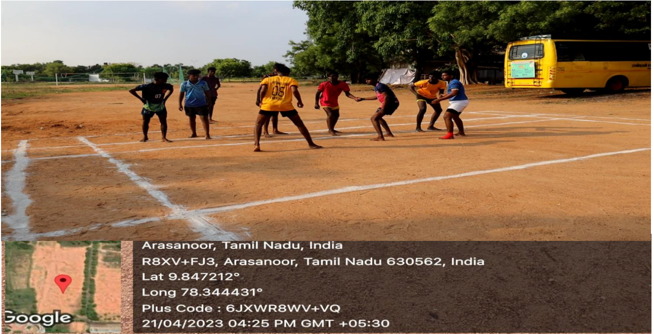
Students are actively participated in men Kabaddi game at PSYEC college ground on [21-04-2023]