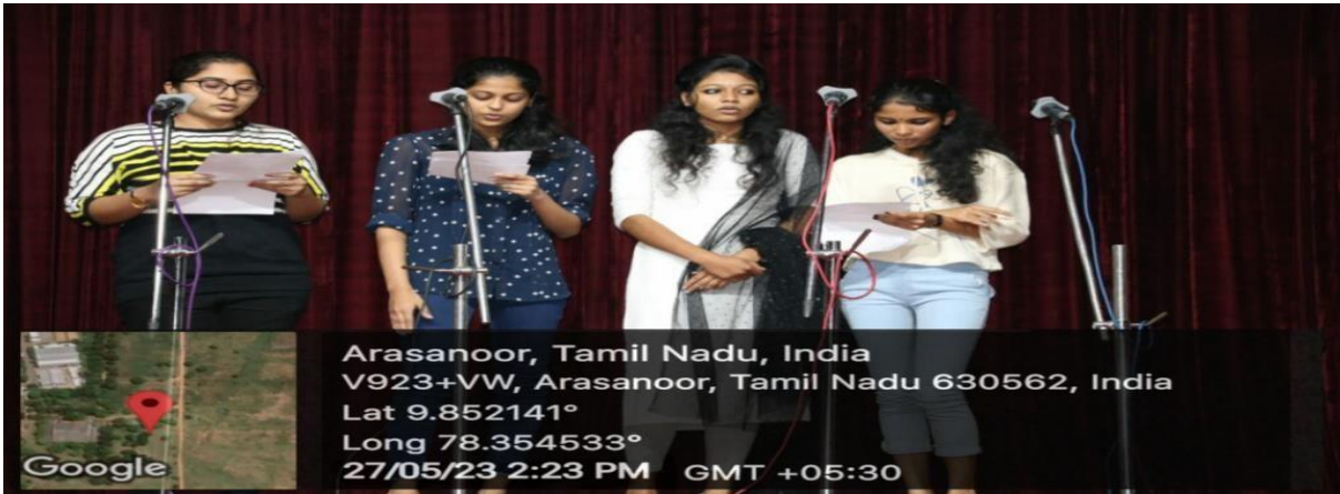
The Singing Competition (Group) started with participants in front of the staffs and the students coordinators