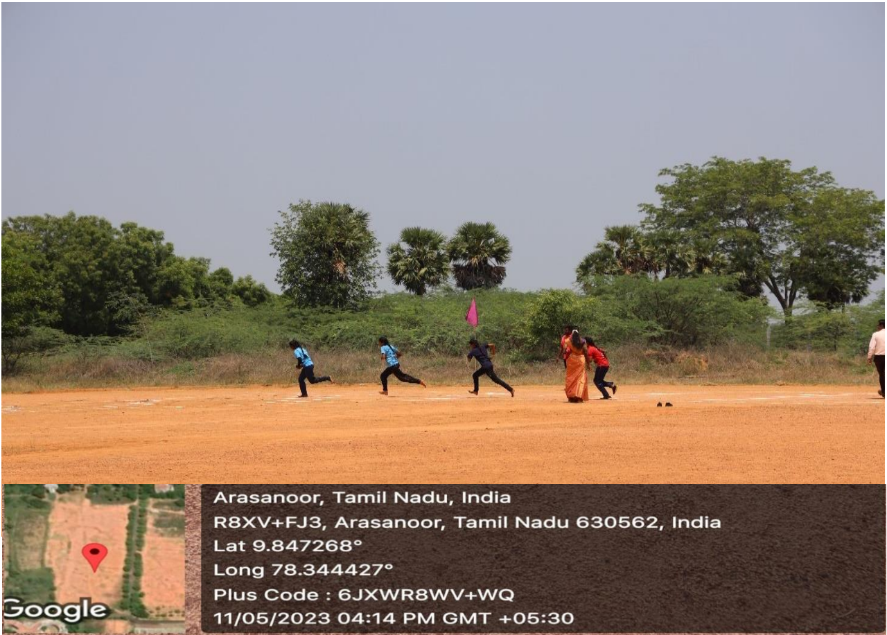
Students are actively participated in women 400 M Track game at PSYEC college ground on [11-05-2023]