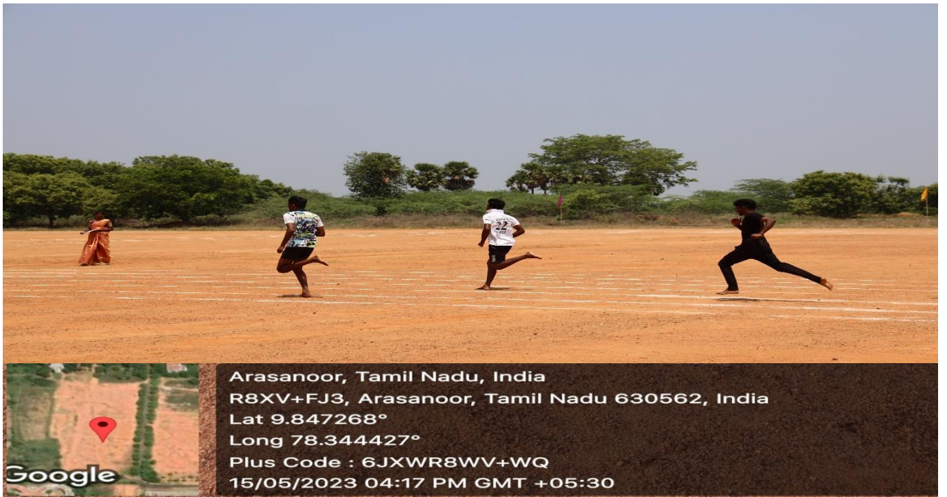
Students are actively participated in men 100 M Track game at PSYEC college ground on [15-05-2023]