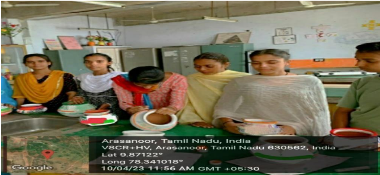
The Mud pot Painting started with participants in front of the staffs and the student coordinators